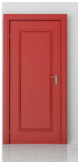
or this door?